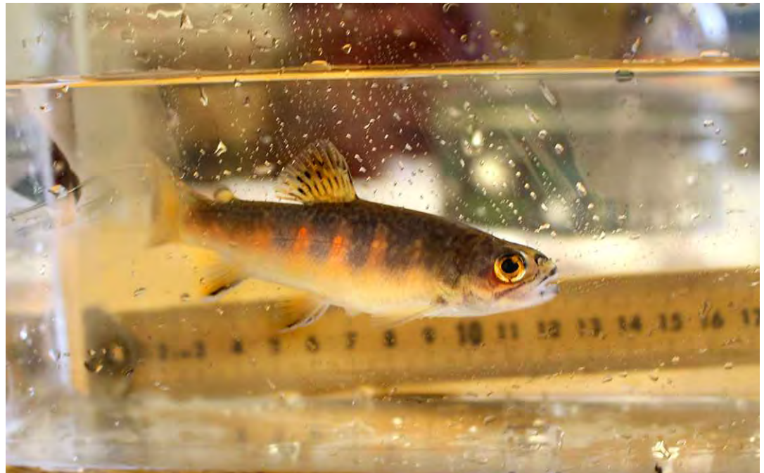
Bubba (from Burgandy Farm School) ate all of his tank mates and is now swimming in Wildcat Hollow Run looking for more to eat.

anglers to keep most of their line off the water. Size #14-18 Gold-ribbed Hares Ears, Pheasant tails, a few tan or olive bead-head nymphs, and some caddis larva should suffice. In the slower water fish streamers, nymphs, and midges under a small indicator. Natural colors (white, tan, yellow, and black) work best. You can also strip the streamers through the larger pools. If all else fails, tie on a soft hackle and start probing the most likely water. This water is popular with anglers, and most of these anglers fish the easy-to-reach spots. You can find virgin water if you avoid the locations where casting is easiest and investigate those fishy looking spots that most anglers pass by.